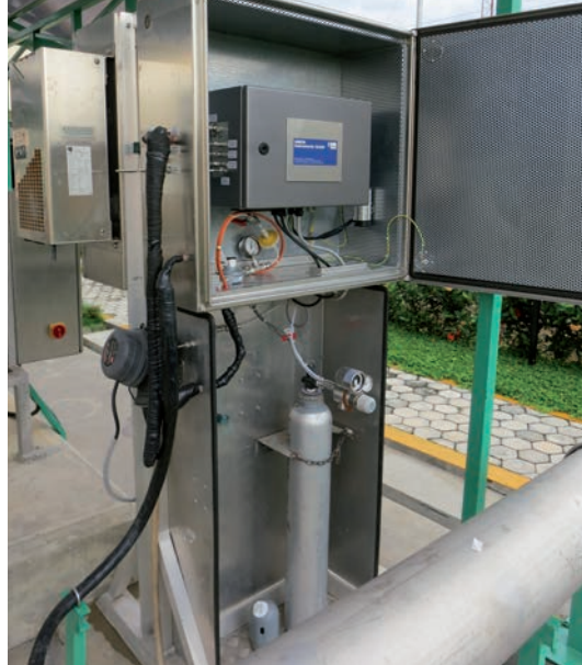
Heated sample gas lines